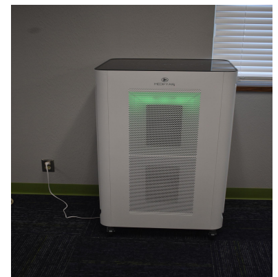
The new air purifier in the 5-12 Library Media Center.