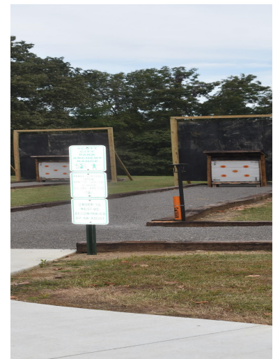
The new archery range at Scott City Park offers three targets up near the walking trail starting entrance.