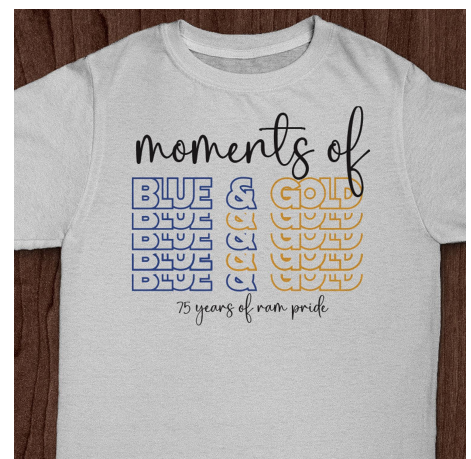
A prototype of the 75th anniversary shirts and yearbook cover for the 2024 high school yearbook. Order yours today!