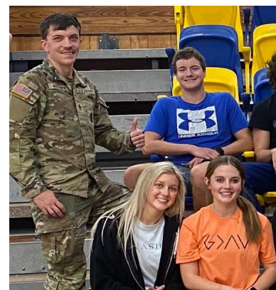
Students pose with a Vet after the "Sweat with a Vet" challenge.