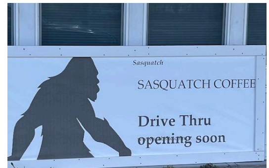
Coming Soon! Sasquatch Coffee with Drive-Thru!