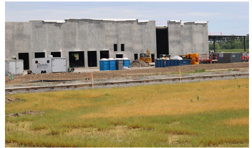
New Amazon distribution center under construction on the outer interstate road.

(Continued from p.2 New High School Girls Basketball Coach)