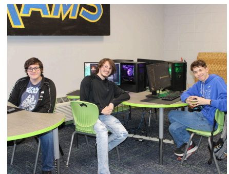
HS Esports practising after school in the library.