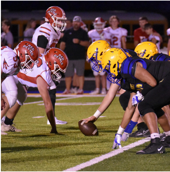
The Rams & Red Devils face off in yearly competition.